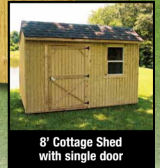
8' Cottage Shed with single door