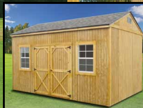
Side Utility or Side Lofted Utility Add Windows to Price