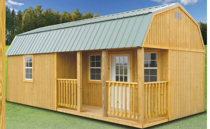
SIDE LOFTED BARN CABIN