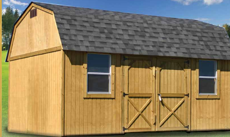
SIDE LOFTED BARN